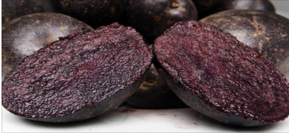
Purple Majesty potatoes contain higher levels of the antioxidant anthocyanin,

A purple potato that growers claim is healthier than the standard variety is going on sale in UK supermarkets. The Purple Majesty has a distinctive deep colour and contains up to 10 times the level of antioxidant, anthocyanins, compared with white potatoes.